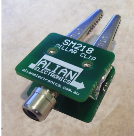
A time saver for Telecom staff

Manufactured in Australia by Alian Electronics Pty. Ltd. 408 Old Sale Rd. Drouin West 3818 Ph. (613) 5625 2545 For details visit www.alianelectronics.com.au